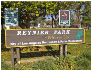
Peace Picnic Celebrate the UN's International Day of Peace