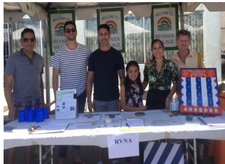
Summer Ice Cream Social & Park Nights