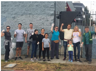
Reynier Village Beautification Days (tools and supplies provided by the City of L.A.)